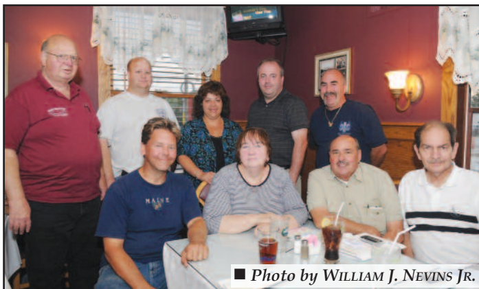
The 2009 Christmas Parade Committee

"This year marks the 40th Anniversary of the Christmas Parade. Over 70 groups and thousands of local residents and families will take part in